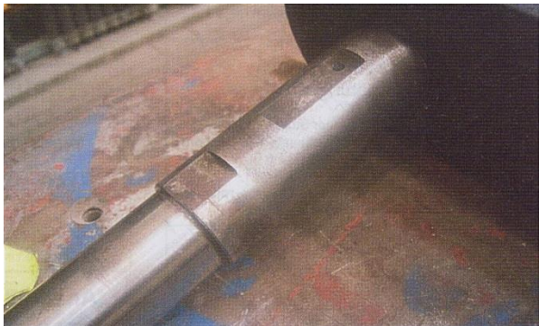
Dismantled chain pins show no signs of wear and tear after a long period of operation