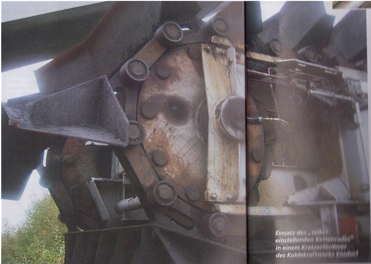
The “self-adjusting chain sprocket” in operation on a scraper conveyor.